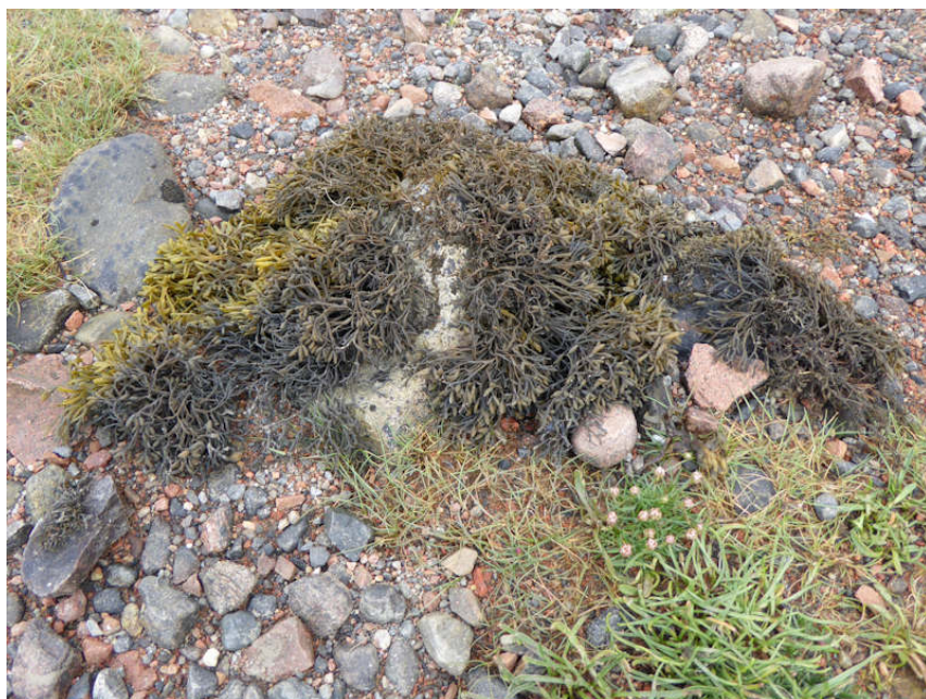
Pelvetia canaliculata on sheltered variable salinity littoral fringe rock