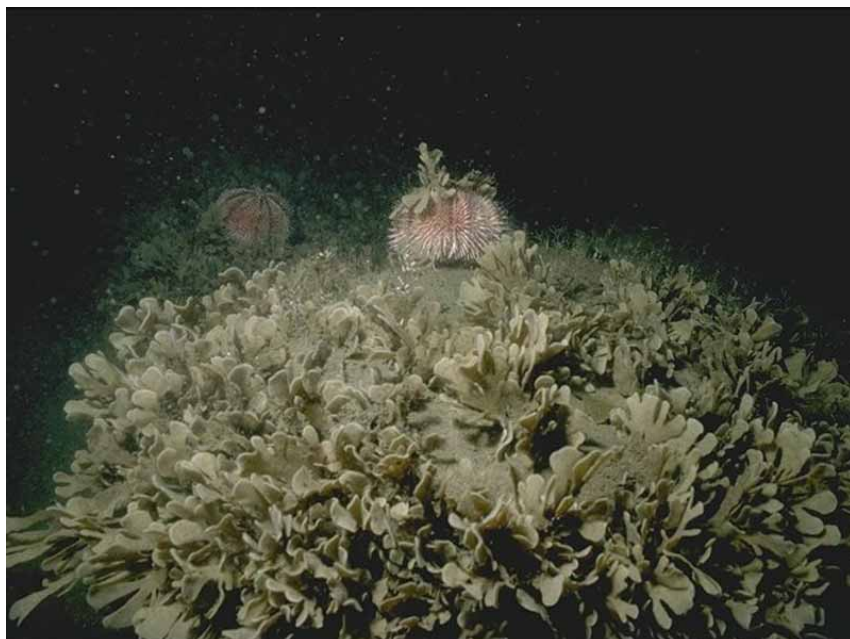
Flustra foliacea on slightly scoured silty circalittoral rock.